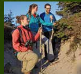
Journey of the Grain of Sand