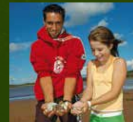
Softshell Clam Fishing