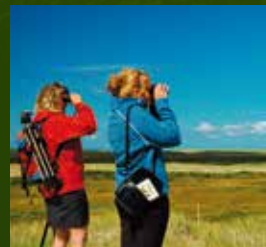
From Freshwater to Salt Water